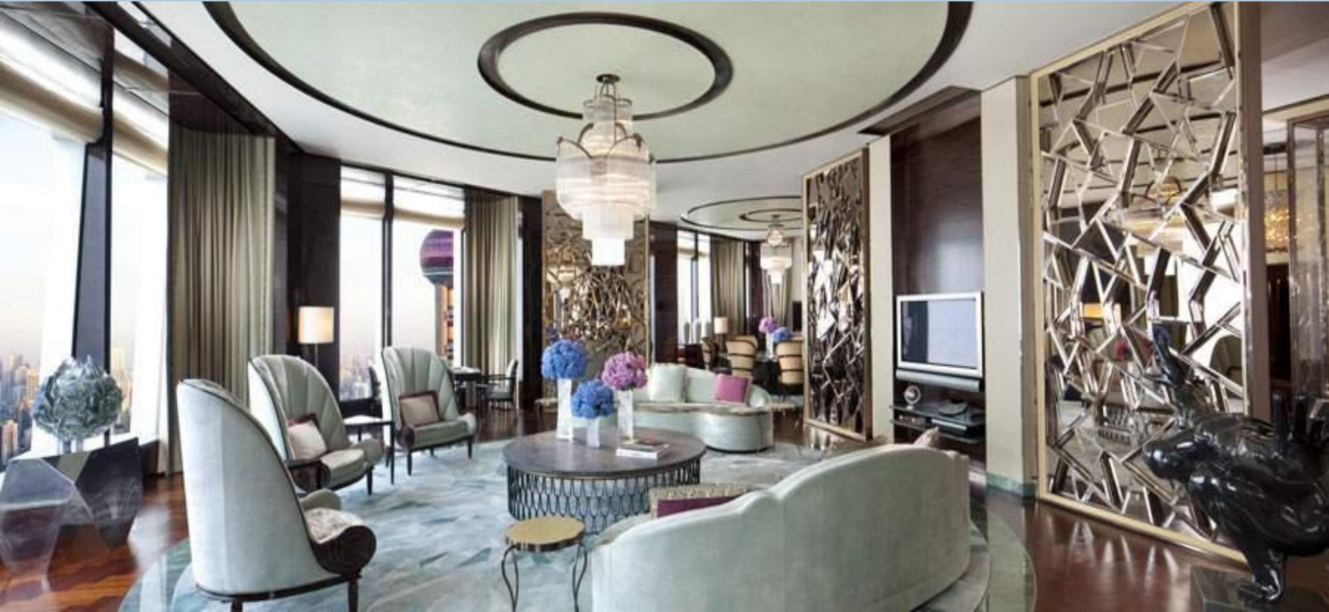
The Ritz-Carlton Suite – Living Room