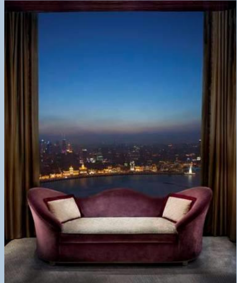
The Ritz-Carlton Suite – Study Room