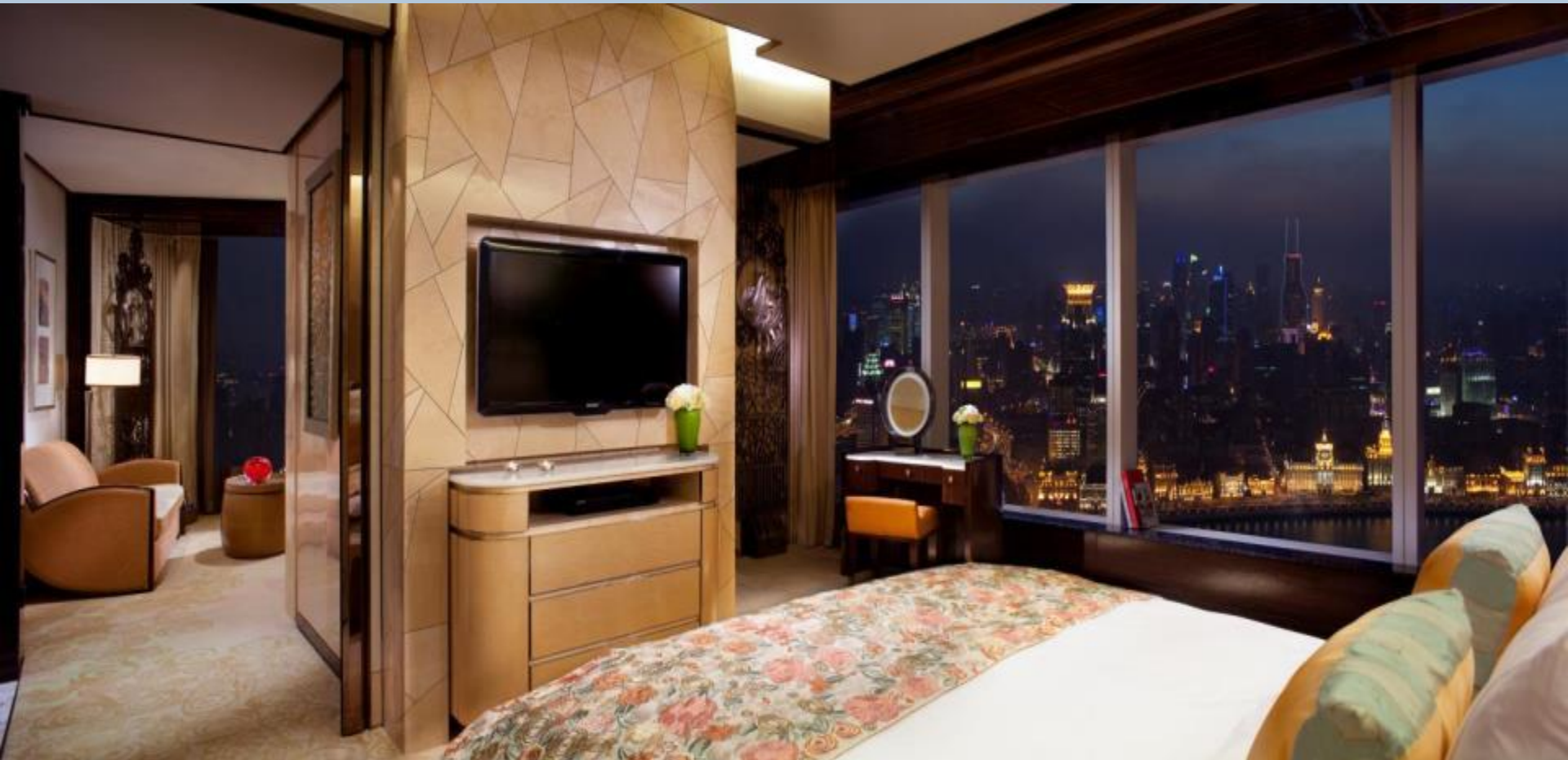
Shanghai Bund View Suite