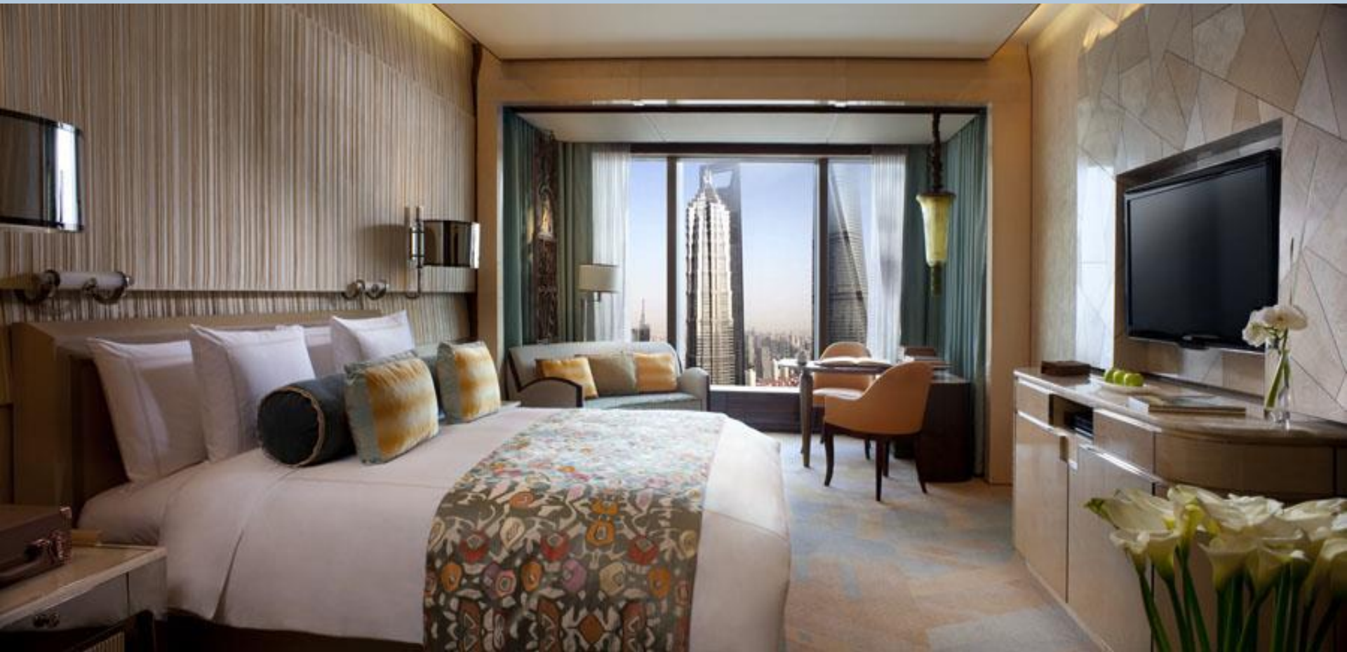
City lights View Room