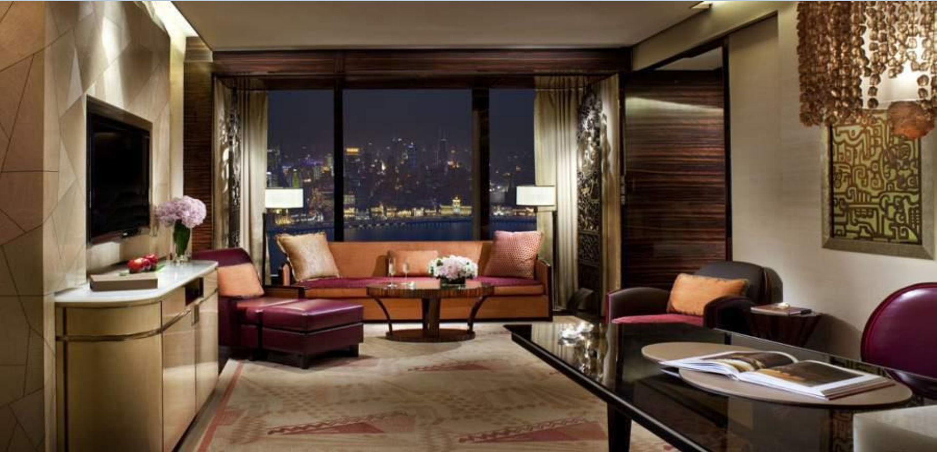
Premier Bund Suite - Living Room