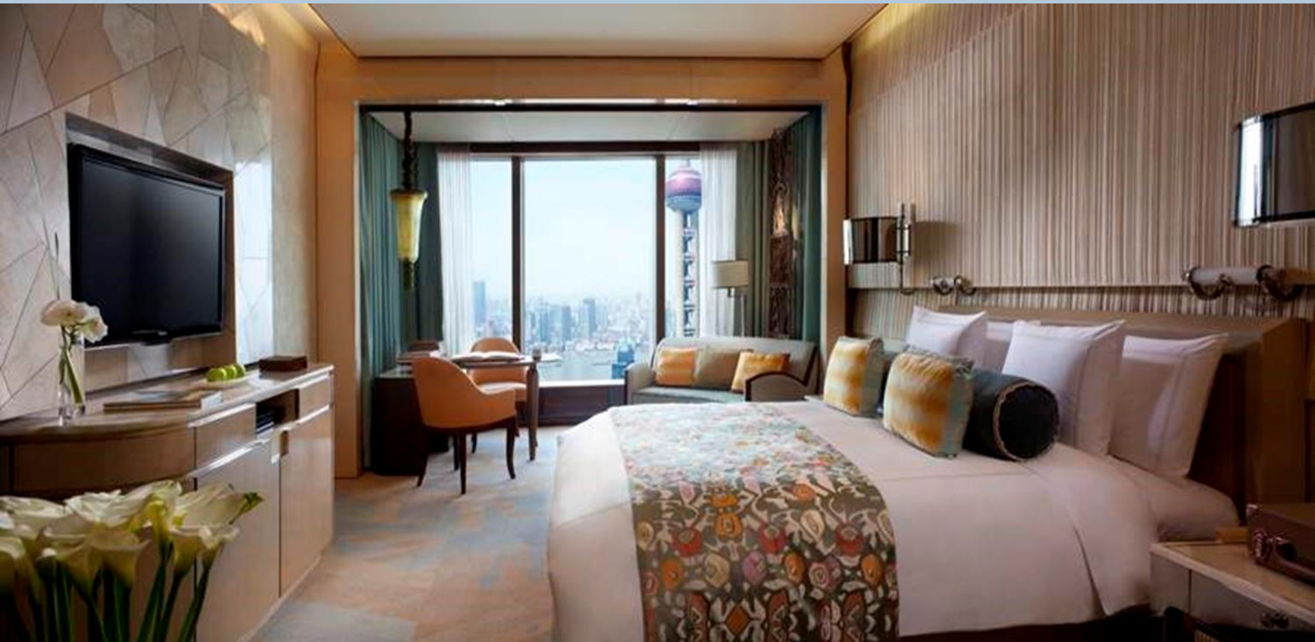
Pearl Tower View