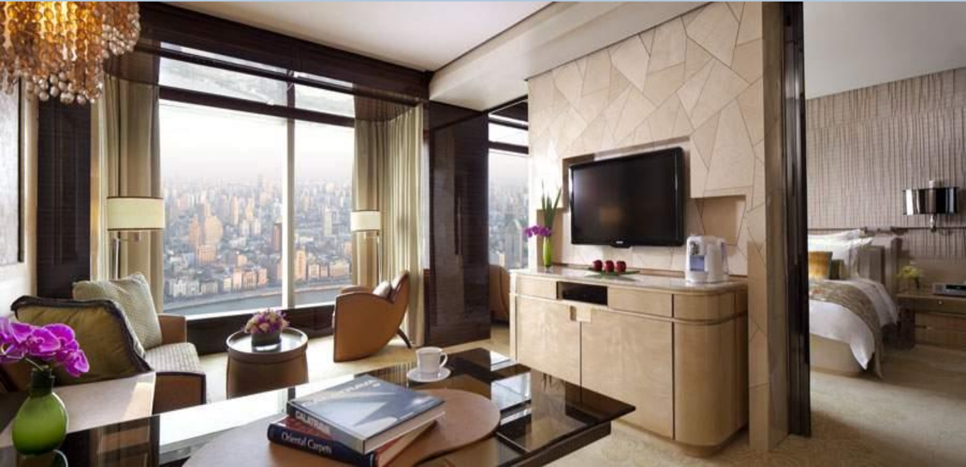
Pearl Tower View Suite