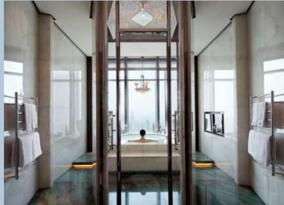
The Ritz-Carlton Suite – Master Bedroom & Bathroom