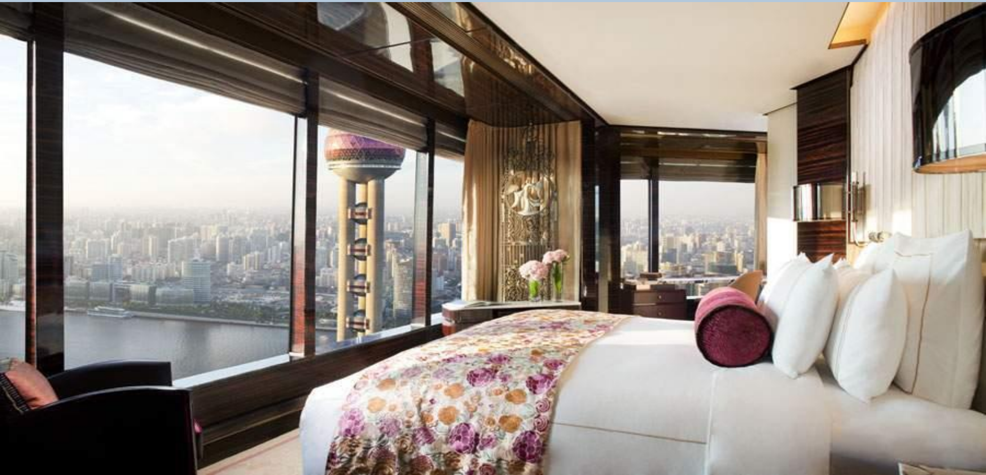
Premier Bund View Suite – Bedroom Room