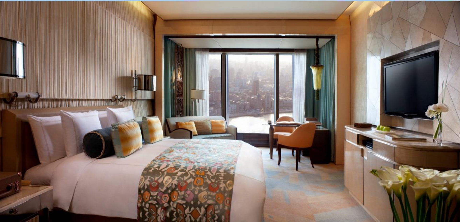
Shanghai Bund View Room