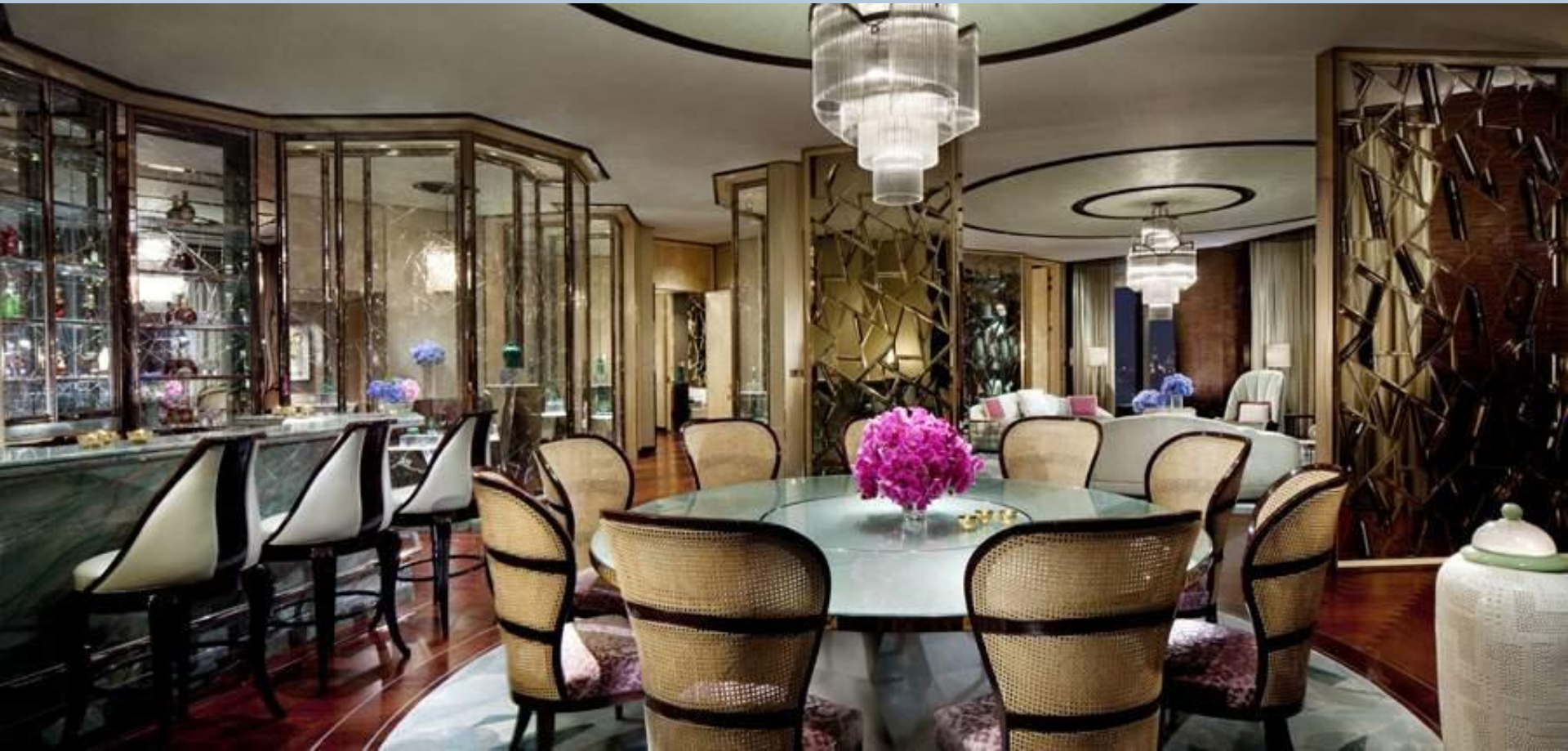
The Ritz-Carlton Suite - overall